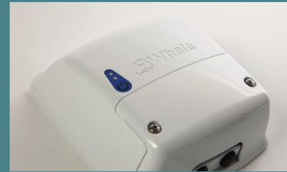
Whale Sense unit (SDA074T)