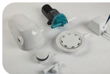
Wet Floor and Tray Gulley kit BP1578