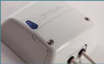
Instant Match Transformer with Bluetooth Technology (SDS236T)