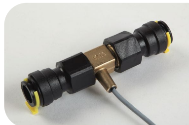
Sika Flow Sensor SDS263T