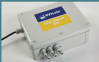
Dry-Deck Control Box (SDS273T)