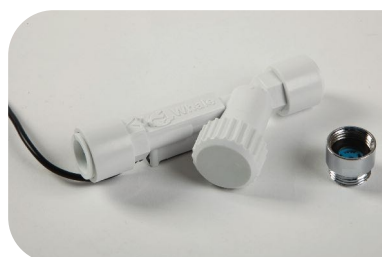
Mixer Valve Conversion Kit AK1570