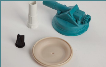
Spare Pump Head Kit (SDS071T)