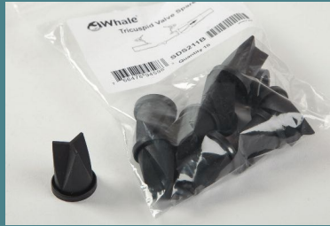
Tricuspid Valves X 10 (SDS211B)