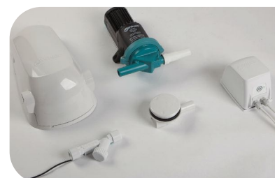
Tray Gulley kit BP1558B