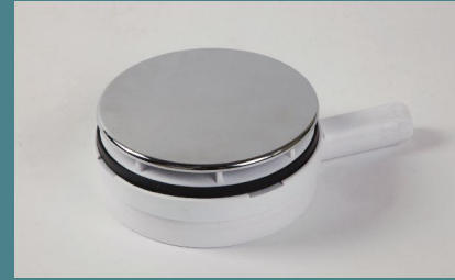
90mm Tray Gulley (AK1695)