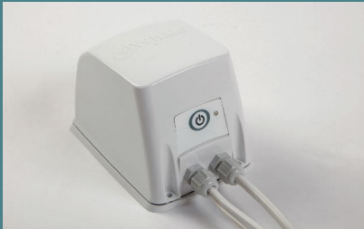
Switch Connect Transformer (SDS081T)