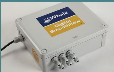
Digital Smoothflow Control Box (SDS243T)