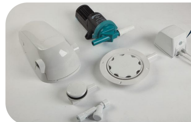
Wet Floor and Tray Gulley kit BP1578