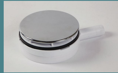
Marmox Tray Gulley (SDA001T)