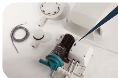
Whale Instant Match ® Kit SDP134T

Active Link Includes Active Link technology