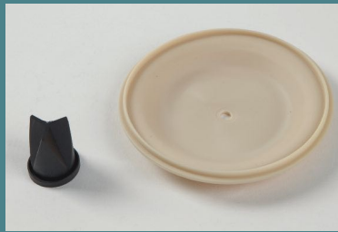
Diaphragm/Valve Kit (SDS061T)