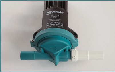
Shower Drain Pump (SDS021T)