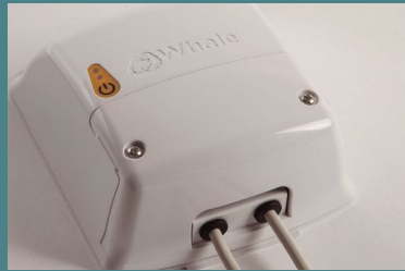
Instant Match transformer with wireless technology (SDS131T - 755.649)