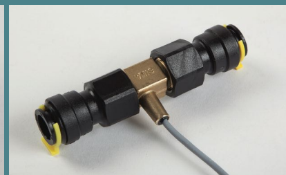
Sika Flow Sensor (SDS263T) (May also be used with the Instant Match and any electric shower)