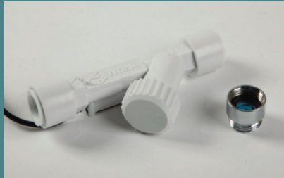
Mixer Valve Conversion Kit (AK1570)